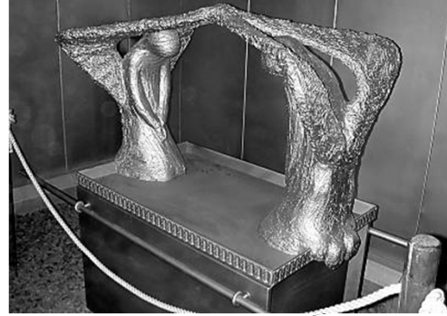
Ark of the Covenant